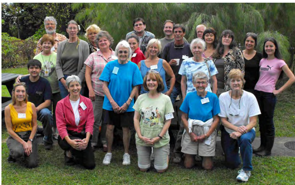
Docent class